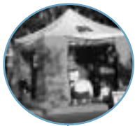
Mendel Art Gallery The funding we received from The Saskatoon Foundation through programs like ArtsSmarts and Quality of Life provides the gallery with seed money for projects that later turn into sustainable programs with the help of corporate sponsorship.